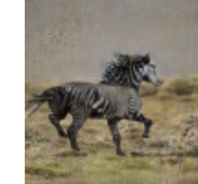
Q_{12}(w, f) \rightarrow P_{0.5}(w, f)