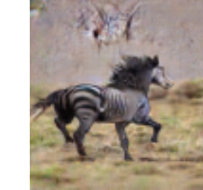
P_{0.5}(w, f) \rightarrow Q_{12}(w, f)